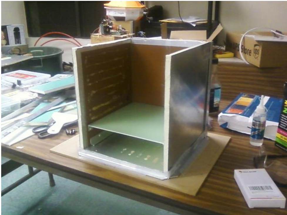
Figure 1 Three walls, base flanges, and test bay floor together on mounting-plate-copy for fit check. Looking in through the starboard wall, which is not present in the photo.