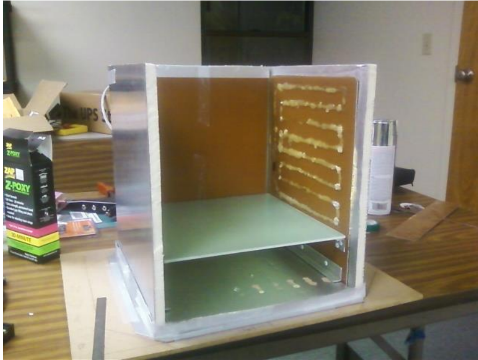
Figure 2: Figure 1 Three walls, base flanges, and test bay floor together on mounting-plate-copy for fit check. Looking in through the starboard wall, which is not present in the photo. Nichrome wire patterns are visible on the wall.