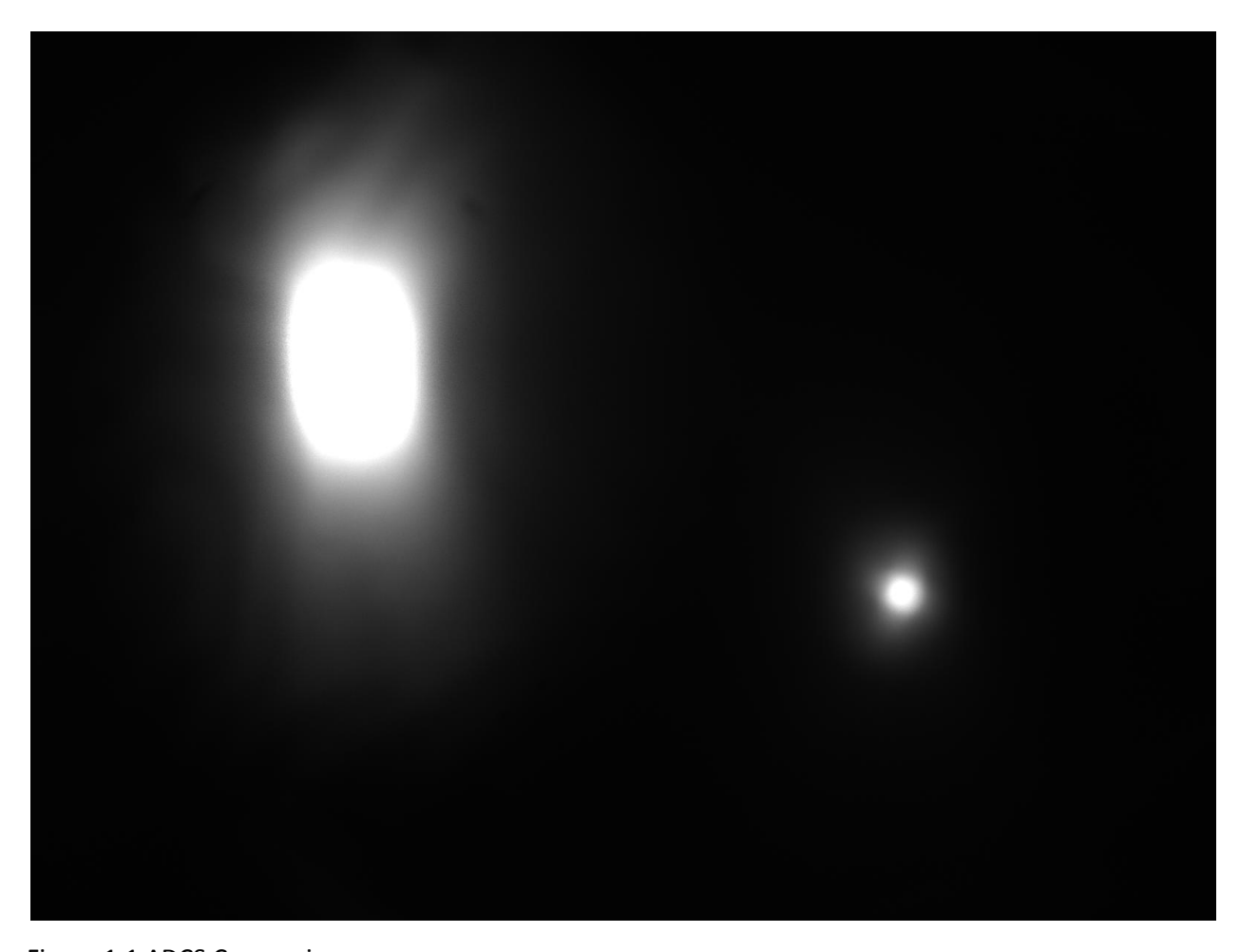
Figure 1.1 ADCS Camera image