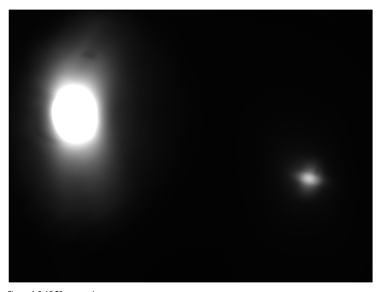
Figure 1.2 ADCS camera image